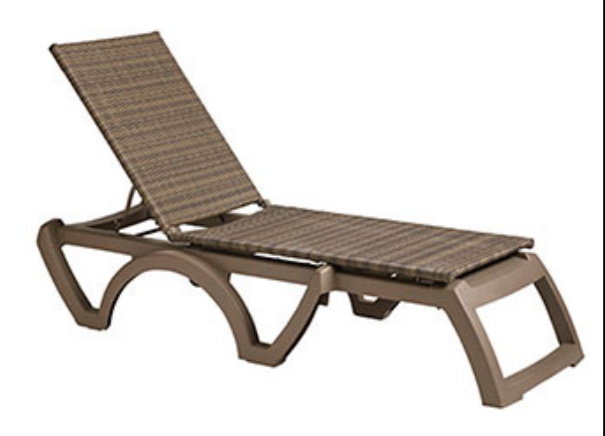
Taupe Frame and Sling