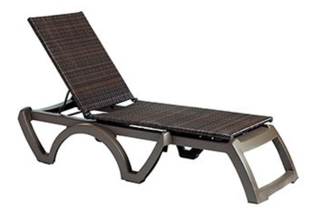
Bronze Frame and Sling