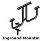
Inground Mounting Clamp