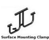
Surface Mounting Clamp