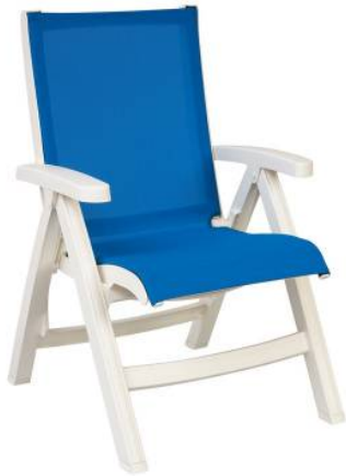
Sling and Frame Colors