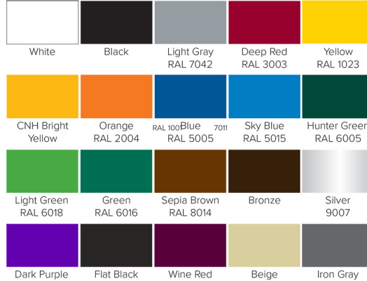
Powder Coated Finishes

PHONE (888) 663-4621 E-MAIL nofinc1@gmail.com www.nationaloutdoorfurniture.com